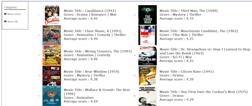
Fig. 9. Results of movie recommendation using personal propensities

Table 2 shows the results of recommended movies using Huh, Lee, Jang, and our method.