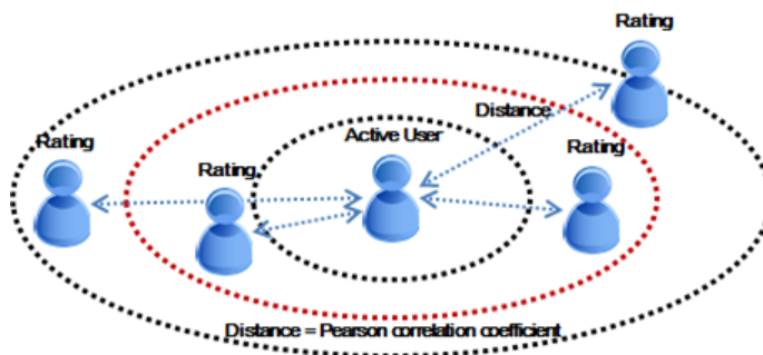
Fig. 1. Collaborative filtering algorithm

Fig. 1 shows a neighborhood-based algorithm that has generally been used in collaborative filtering systems [7]. The active user calculates distances to other users and selects as its neighbors the number of users who are located at nearest distances. The distance between users can be calculated using the Pearson correlation coefficient, the mean-square difference, or vector similarity. In [18], the Pearson correlation coefficient produced a better result than the vector similarity, and [19] showed that the Pearson correlation coefficient brought about a better outcome though a selection of either a too small or too large number of neighbors might lead to a reduction in its prediction capability. When distances to other users have been calculated, a predicted score for an item can be computed by summing other users' rated scores in proportion to their